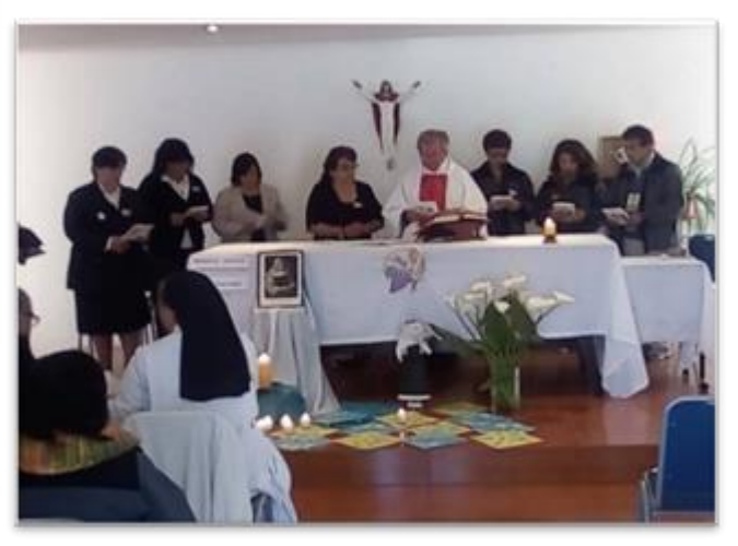
Laicos que hicieron Promesa