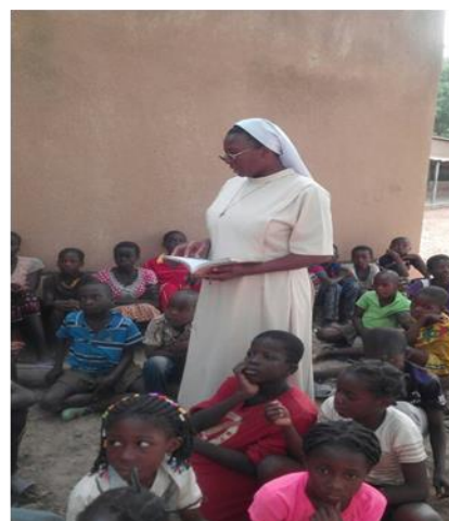
Toécé Catechism class