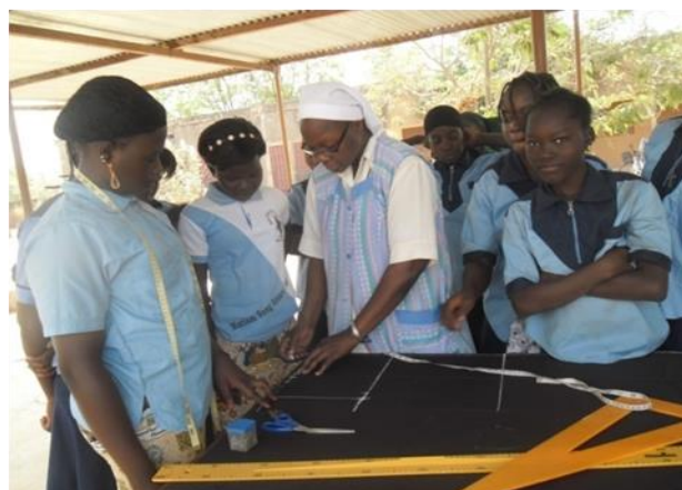
Class in Boassa