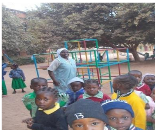
Kindergarden in Dassasgho (Ouagadougou)