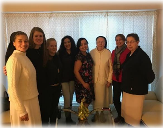
Rosary House of studies in Washington

Collaboration: Working with the laity has been a thrust from the initial years in the USA and has continued to be so in the different areas of the country and of the world where we are and have been.