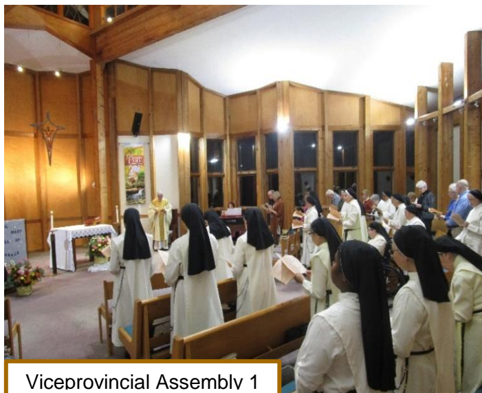
Viceprovincial Assembly 1

Missionary spirit: Announce the Gospel of the Lord in other countries and areas of the world: Korea, India, and Honduras.