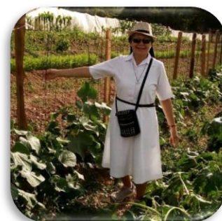
Guaimaca At the farm