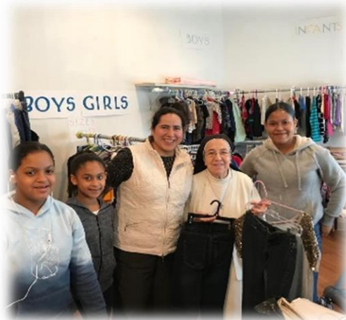
At Marie's Place