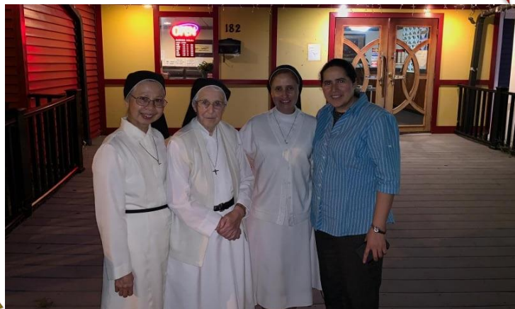
Dourdan with postulant