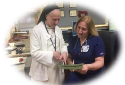
Fall River Pastoral

In 1927, a Nursing School was established, adjacent to the Hospital. Many young women were trained there and several of them joined the Congregation.