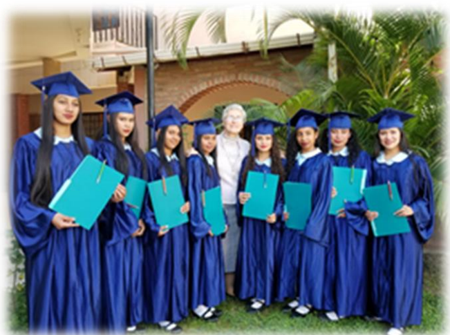
Guaimaca graduating class