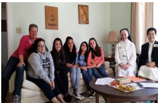
Fall River Diocesan Ministry

Missionary spirit: Announce the Gospel of the Lord in other countries and areas of the world: Korea, India, and Honduras.