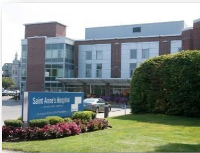
St. Anne's Hospital