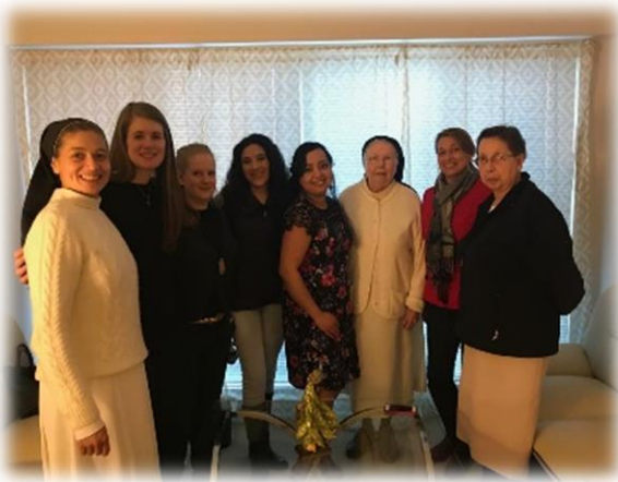
Rosary House of studies in Washington

Collaboration: Working with the laity has been a thrust from the initial years in the USA and has continued to be so in the different areas of the country and of the world where we are and have been.