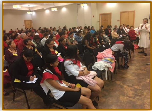
Washington, with youth and parents