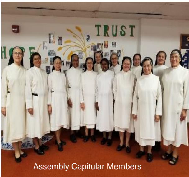
Assembly Capitular Members