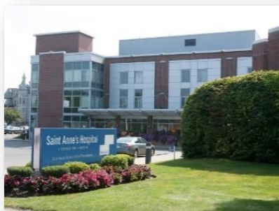
St. Anne's Hospital