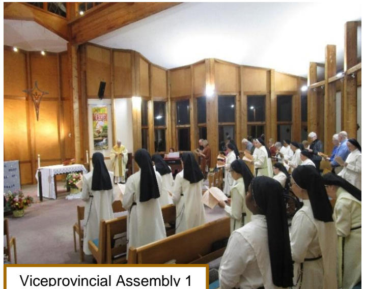
Viceprovincial Assembly 1

Missionary spirit: Announce the Gospel of the Lord in other countries and areas of the world: Korea, India, and Honduras.