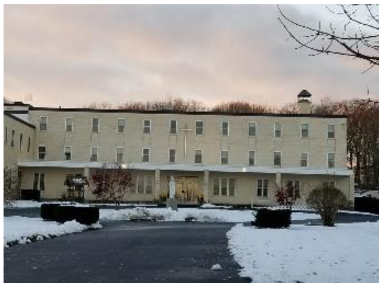
Vice Provincial House in Dighton