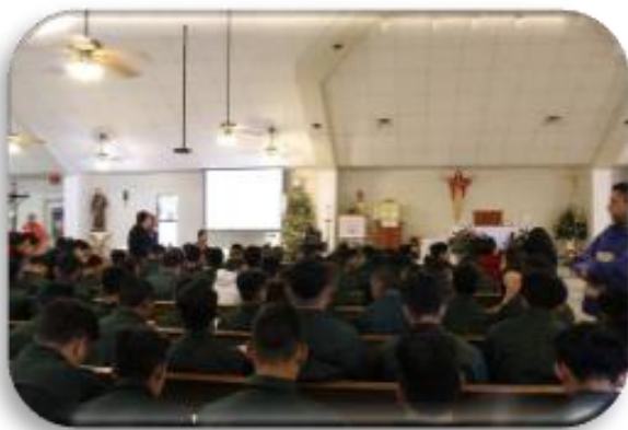
Brownsville with emmigrant youth

Evidence in the timely response to the needs of the marginalized, be they the French-Canadian immigrants, the migrant workers in Texas, the new immigrants in Washington, DC; Central Falls and Providence, Rhode Island, Fall River, Massachusetts; native Americans in Gallup, New Mexico; different ethnic groups in Sacramento, California