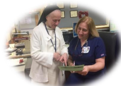
Fall River Pastoral

In 1927, a Nursing School was established, adjacent to the Hospital. Many young women were trained there and several of them joined the Congregation.