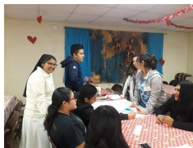
With the youth Brownsville

Through the years, other communities were established to respond to a variety of needs and ministries in other areas and dioceses of the United States: Fall River, Massachusetts; Brownsville, Texas; Providence, Rhode Island; Gallup, New Mexico.