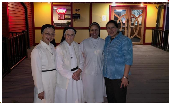
Dourdan with postulant