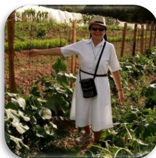
Guaimaca At the farm