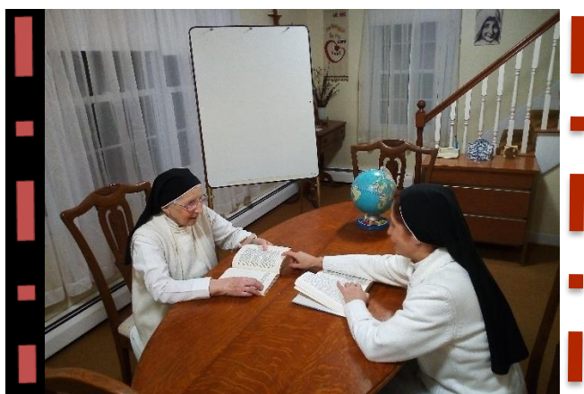
Good Formation time

We are from ten countries of origin: USA, Honduras, Colombia, India, Puerto Rico, El Salvador, Philippines, Spain, Perú and Mexico.