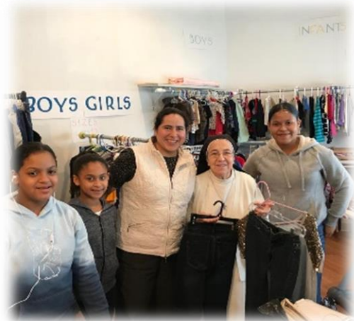
At Marie's Place