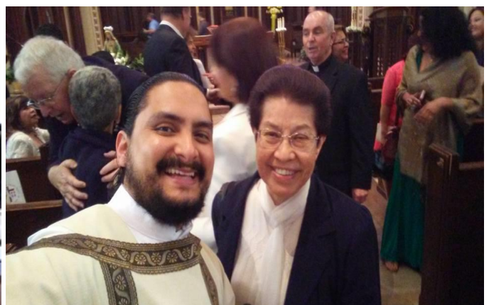
Fall River Diocesan Ministrv