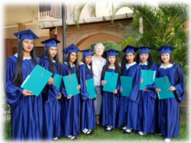
Guaimaca graduating class